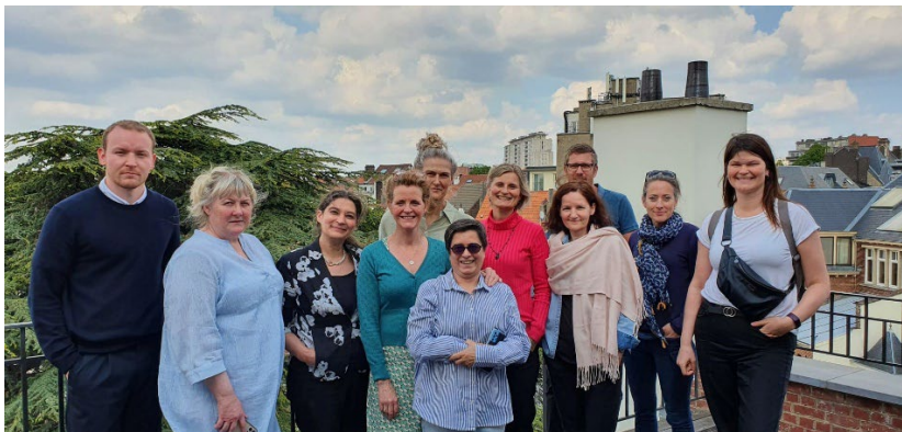
Photo: Project team during the kick-off meeting in Brussels

The project will present these materials to the European Commission, and hopefully they will acknowledge the work from the SHE4AHA project as a concrete and accessible contribution to the implementation of their European strategy within active and healthy ageing, in which they will engage to disseminate further to the member states.